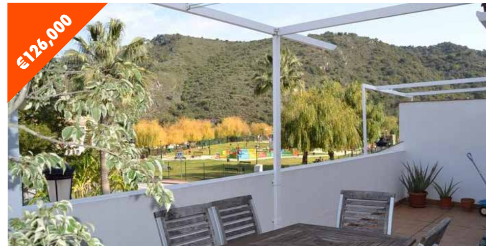
BENAHAVÍS 2 Bed • 2 Bath • Built 68 m 2 • Ref KMSSP07 Lovely apartment with a huge 24 m 2 terrace with stunning countryside views located in the heart of this Gastro town.