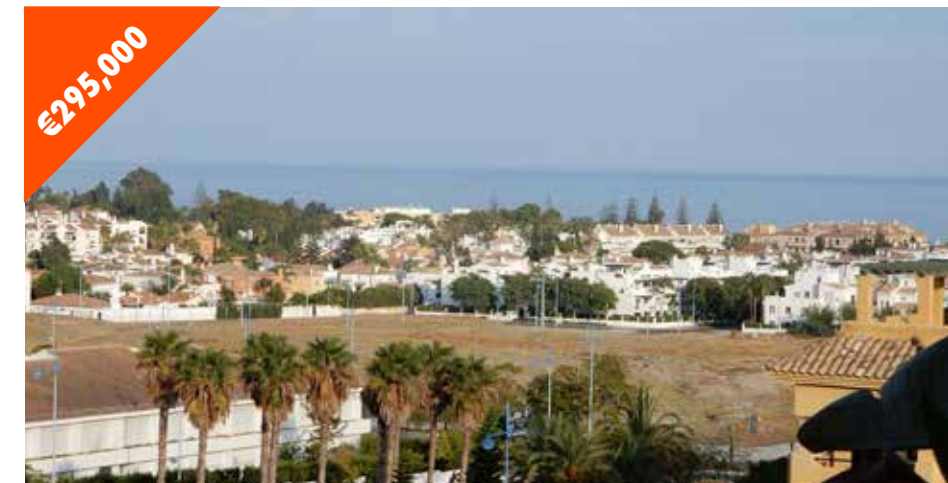
SAN PEDRO 2 Bed • 2 Bath • Built 93 m 2 • Ref KMSSP248 Penthouse with panoramic sea and boulevard views from the 60m 2 terrace in the popular beachside area of Nueva Alcantara.