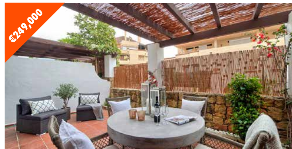
MARBELLA 2 Bed • 2,5 Bath • Built 120 m 2 • Ref KMSSP191 Wonderful duplex apartment with 30m 2 garden in Coto Real, nr the Mosques, off the Golden Mile.