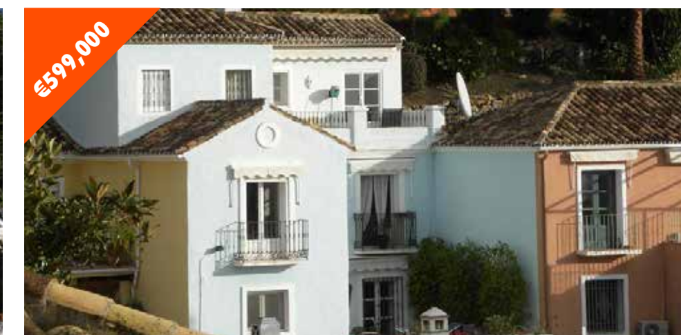
BENAHAVÍS 3 Bed • 3 Bath • Built 182 m 2 • Ref KMSSP255 Stunning house located in La Heredia with panoramic views from South facing terraces, recently reformed to a very high standard.