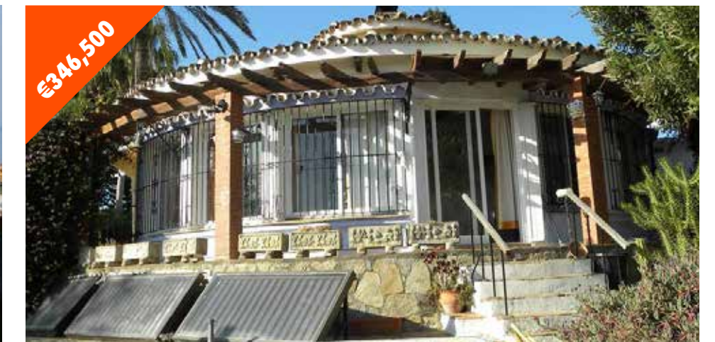
ESTEPONA 4 Bed • 2 Bath • Built 130 m 2 • Ref KMSSP245 Detached villa with sea views in a large 1000m 2 plot with private pool, various terraces, studio and a separate guest annex.