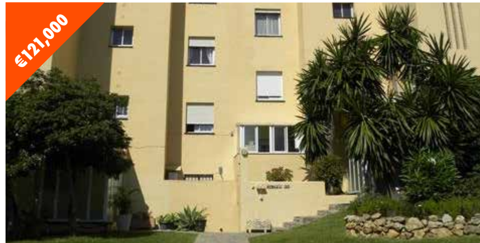
CALYPSO 2 Bed • 1 Bath • Built 72 m 2 • Ref KMSSP158 Quaint West facing garden apartment in very good condition with a new kitchen. Easy walk to beach & shops.