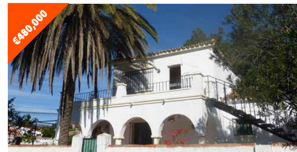
COSTABELLA 4 Bed • 3 Bath • Built 230 m 2 • Ref KMSSP216 A rare opportunity to acquire this detached beachside villa with sea views in an 850m 2 plot that is in need of total reformation.