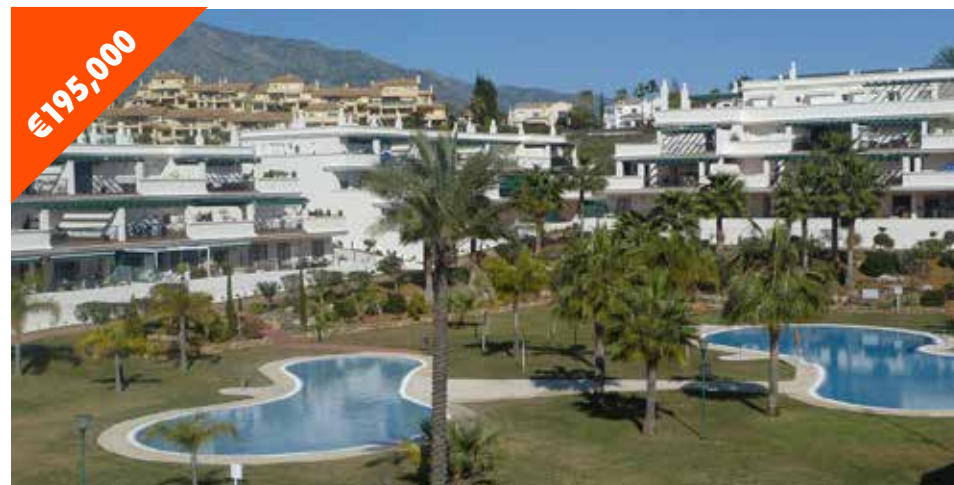
NUEVA ANDALUCÍA 2 Bed • 2 Bath • Built 97 m 2 • Ref KMSSP212 This apartment in Locrimar V has a massive 70m 2 terrace and is a short walk to the beach and amenities of Puerto Banus.