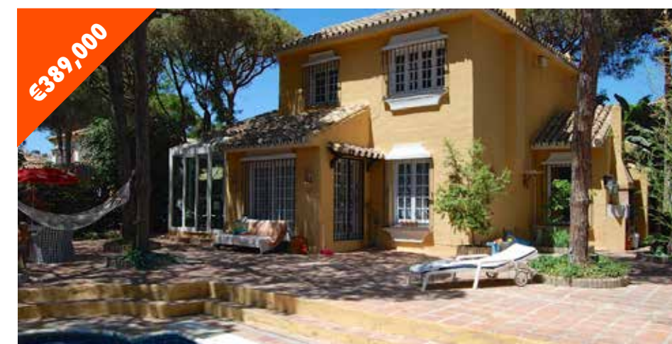
CALAHONDA 3 Bed • 2 Bath • Built 122 m 2 • Ref KMSSP217 Detached villa with pool. Lots of character and some sea views, located within walking distance to all local amenities.