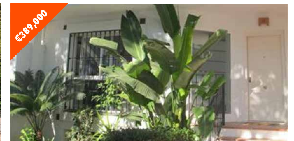
NUEVA ANDALUCÍA 4 Bed • 2,5 Bath • Built 250 m 2 • Ref KMSSP250 Reformed townhouse with 30m 2 garden in the popular area of Los Naranjos de Marbella. Walk to golf, padel and local shops.