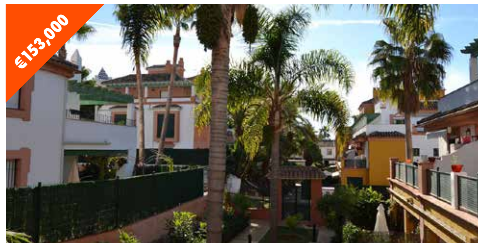
DIANA PARK 2 Bed • 2 Bath • Built 70 m 2 • Ref KMSSP247 Modern apartment in a most sought after location being an easy walk to a wide variety of shops, bars, restaurants and the beach.