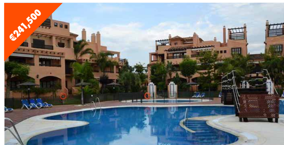
NEW GOLDEN MILE 2 Bed • 2 Bath • Built 111 m2 • Ref KMSSP37 Lovely apartment in Hacienda Del Sol, just a moments walk from the local beautiful sandy beaches. Just reduced in price!