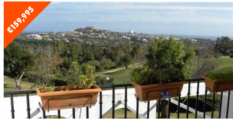
LA QUINTA 2 Bed • 2 Bath • Built 78 m2 • Ref KMSSP14 Penthouse with stunning views reduced by €75,000 now amazing value for money for a property of this quality in this location.