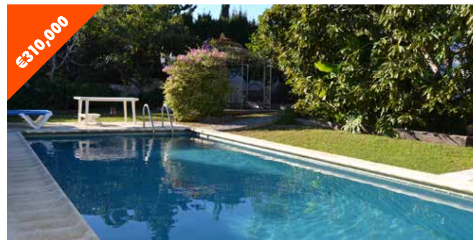
GUADALMINA 2 Bed • 2 Bath • Built 84 m2 • Ref KMSSP112 Detached villa in private plot of 700m2 with easy access to amenities, surrounded by golf courses, walk/cycle to San Pedro.