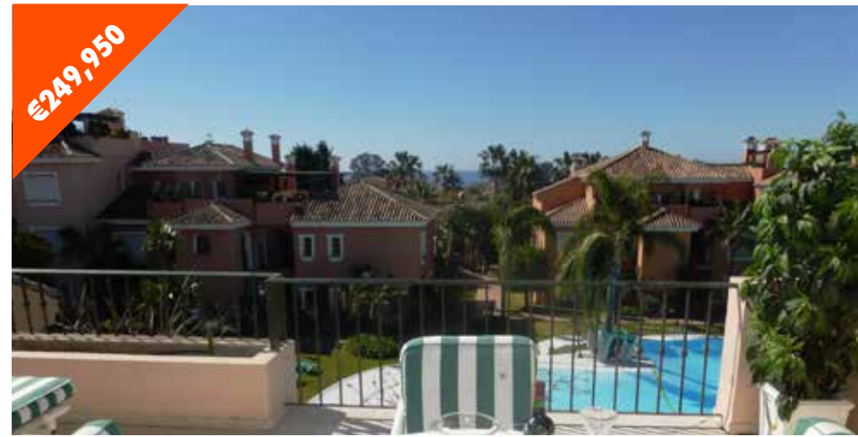
NEW GOLDEN MILE 2 Bed • 2 Bath • Built 120 m2 • Ref KMSSP32 Priced to sell. This South facing penthouse has sea views, and overlooks the swimming pool and communal gardens.