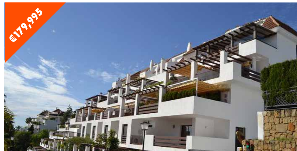
MARBELLA 2 Bed • 2,5 Bath • Built 120 m2 • Ref KMSSP22 Cheapest duplex in Coto Real II, just reduced by € 50,000 for a quick sale. Situated in one of the most exclusive areas in Marbella.