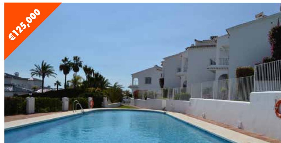
EL PARAÍSO 2 Bed • 2 Bath • Built 72 m2 • Ref KMSSP136 Sunny South Facing Apartment In El Paraiso with the most stunning open views of golf and the coastline.